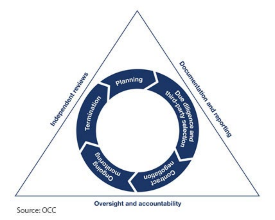
Figure 1 – Risk Management Life Cycle for Third Party Risk, Office of the Comptroller of the Currency (OCC)

Adequate vendor management commences with contracting. This lifecycle model highlights the key preliminary planning, diligence, and negotiations steps to ensure that vendors adhere to the firm's security policies. While ongoing monitoring is critical, so too is planning for the termination of the relationship to ensure that access to networks is severed and confidential data is returned.